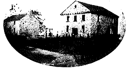
Jail (left) and Courthouse on the Public Square (Present site of old W.H.S.)