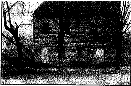
the Thomas Morris Tavern